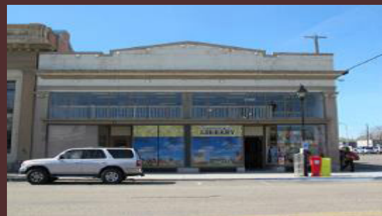
Dewey Building facade built by former Mayor E.H. Dewey