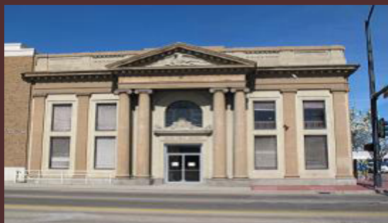
Eleventh Ave Neo Classical Facade of former bank

The buildings are historically and architecturally significant and have been well maintained. Their excellent craftsmanship and intriguing space make them good candidates for rehabilitation and restoration.