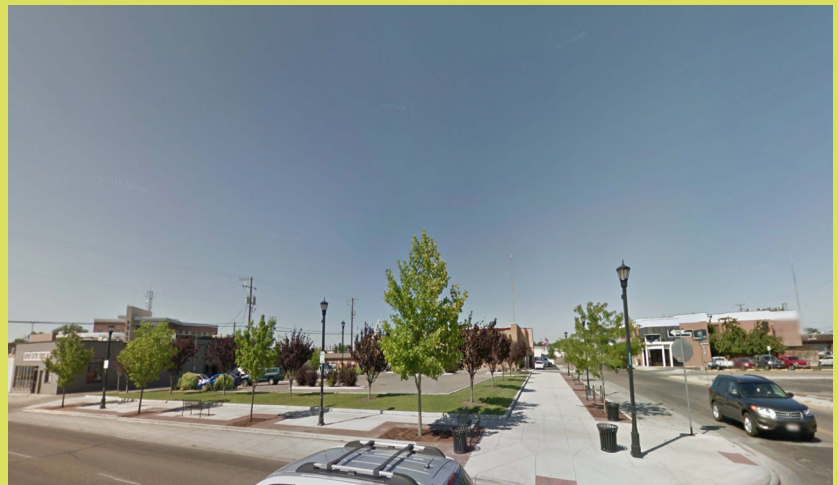
View from 2nd Street South