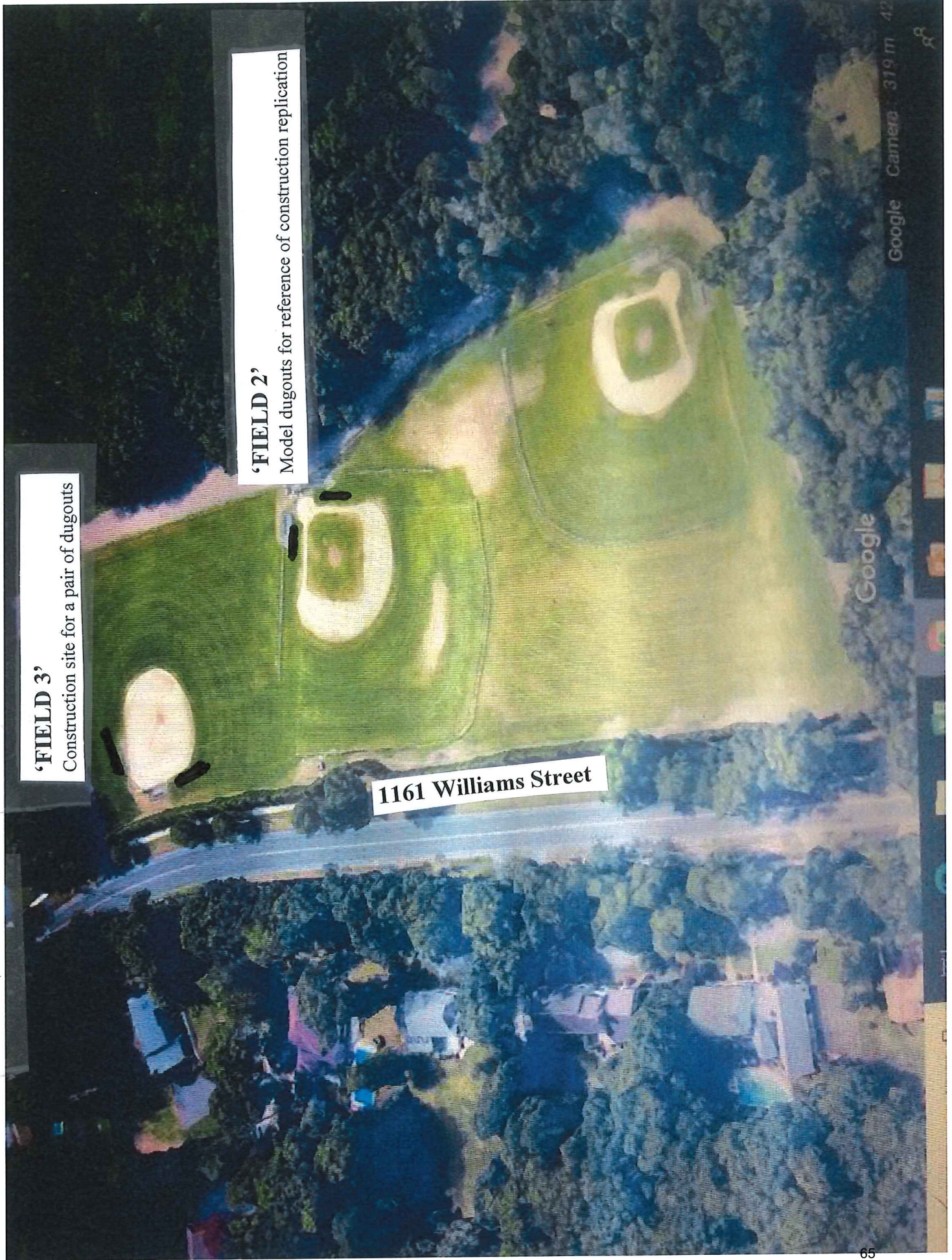
'FIELD 3' Construction site for a pair of dugouts