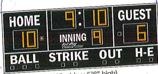
MP-7114-2 (14'0" wide x 5'6" high) Four-digit time clock - Featuring period caption