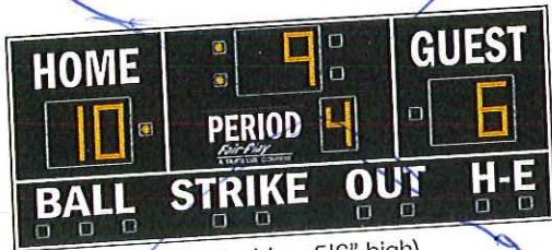
MP-7114J-2 (14'0" wide x 5'6" high) Two-digit jumping clock