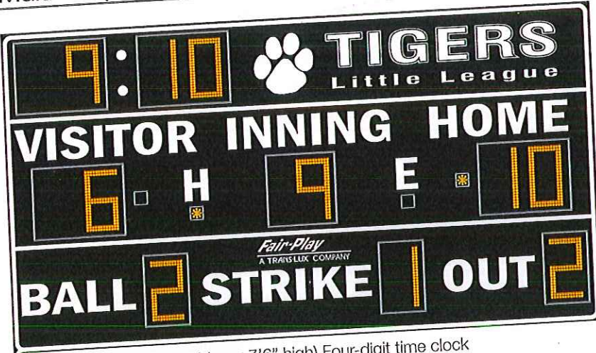
MP-7200-2 (14'0" wide at top x 7'6" high) Four-digit time clock Logo space: 5'0" wide x 2'3" high