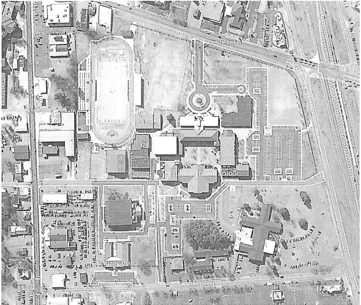
Cartersville High School 320 East Church Street Cartersville, Georgia 30120