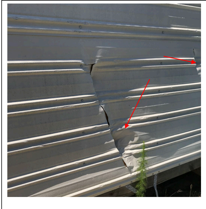
Closer view of holes in side of building