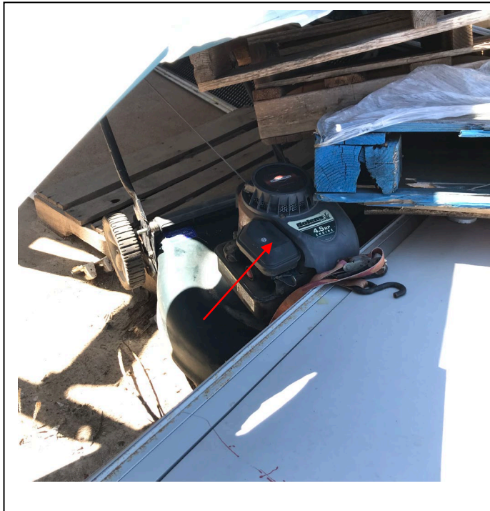
Building collapsed on lawn mower