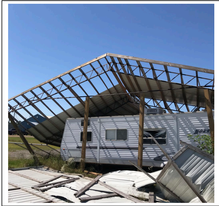
High winds caused 74 FT long x 40 FT wide pole barn to collapse