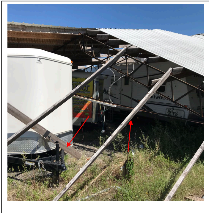
High winds broke (26) 2-IN x 6-IN x 74 FT long rafter