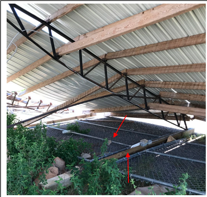
(14) 8 FT high x 11 FT long 3 strand barbwire chain-link fence and (8) 5-IN x 5-IN x 16 FT high post was broken in building collapse