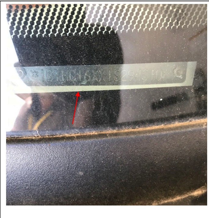
VIN to truck is 1B7HC16XX1S294310