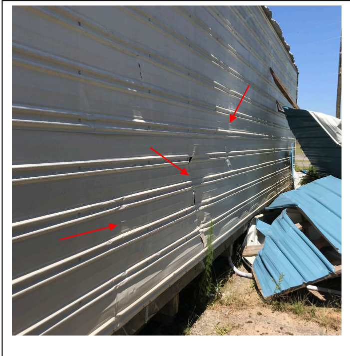
Wind blown debris left dents and holes along (3) 42 wide x 30 FT long metal side