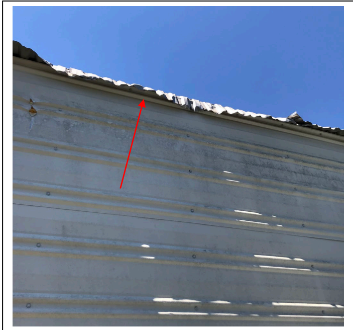
390 SF of roof AG panel was damage by wind-blown debris