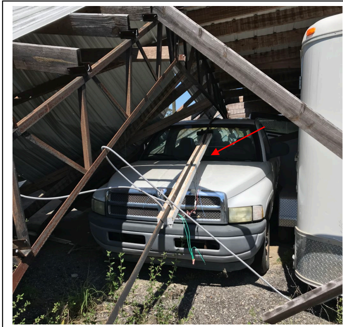
A Dodge truck was damage when building collapsed