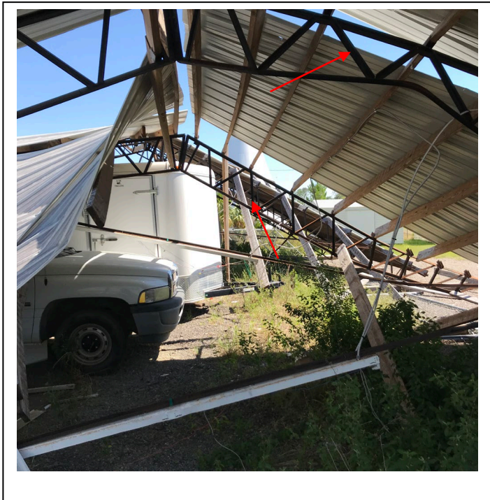
1.5 FT wide x 26 FT Long metal trusses were broken by high winds