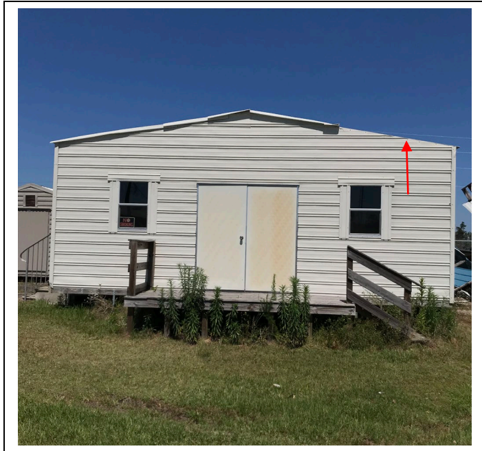
Health Department portable is a 720 SF metal building with gabled roof. 26 LF of flashing has been torn from building.