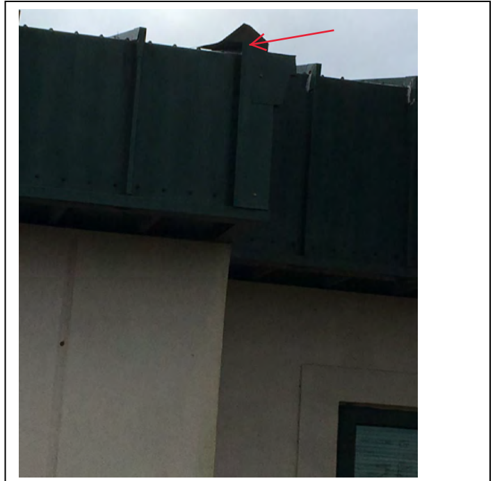
Photo 6: Green metal flashing on roof edge corner, left of front entrance, bent by high winds