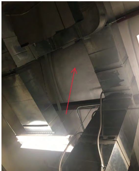
Photo 11: Vinyl backed fiberglass R19 rolled insulation saturated with rain water blown under ridge vent