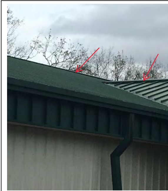
Photo 9: Ridge gasket under the roof ridge cap in the 2003 addition section, detached by wind driven rain and high winds