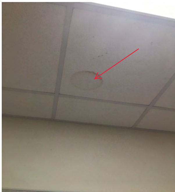
Photo 15: 2 FT x 2 FT White acoustic ceiling tile water damaged by rain water blown under ridge vent