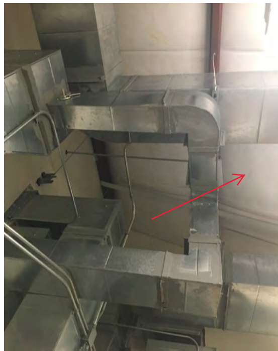
Photo 12: Vinyl backed fiberglass R19 rolled insulation saturated with rain water blown under ridge vent