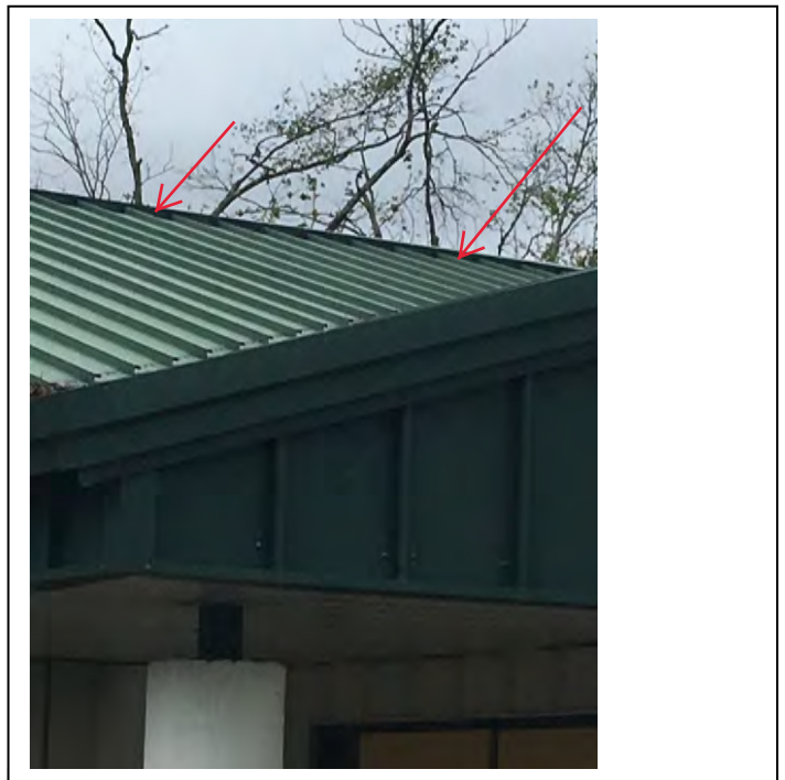
Photo 8: Ridge gasket under the roof ridge cap in the 2003 addition section, detached by wind driven rain and high winds