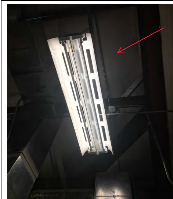
Photo 13: Vinyl backed fiberglass R19 rolled insulation saturated with rain water blown under ridge vent