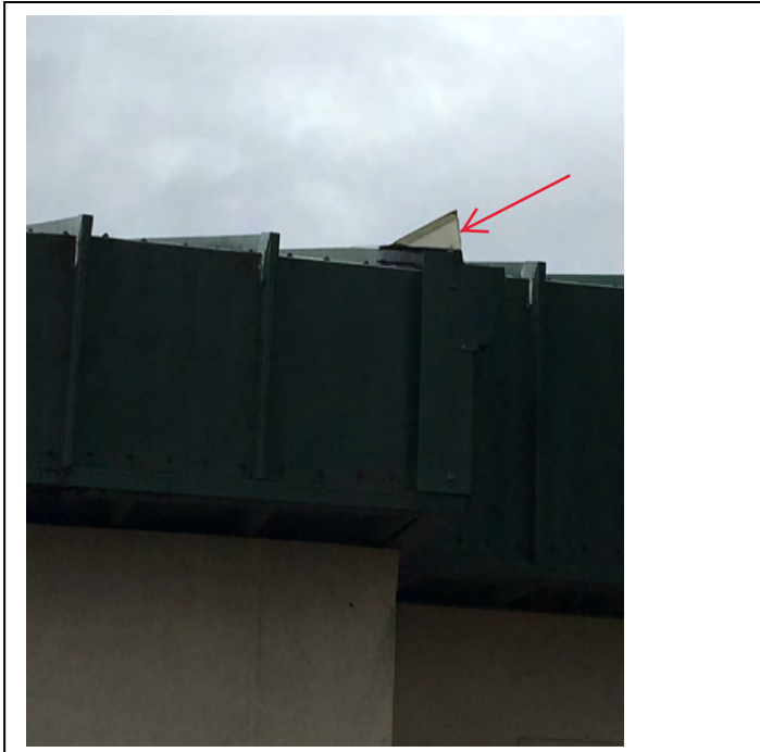
Photo 5: Green metal flashing on roof edge corner, right of front entrance, bent by high winds