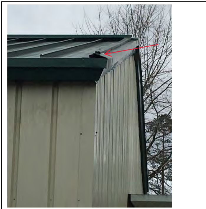
Photo 7: Green metal flashing on roof edge corner, south rear of 1997 building, bent by high winds