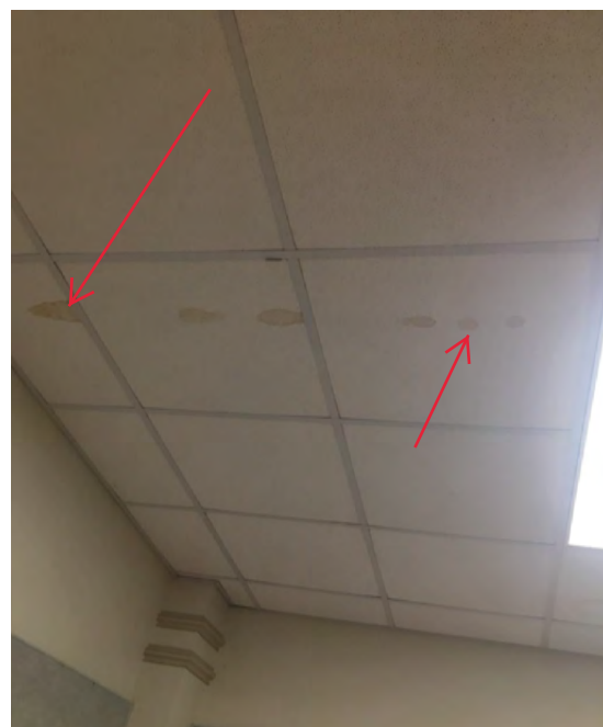
Photo 16: 2 FT x 2 FT White acoustic ceiling tile water damaged by rain water blown under ridge vent