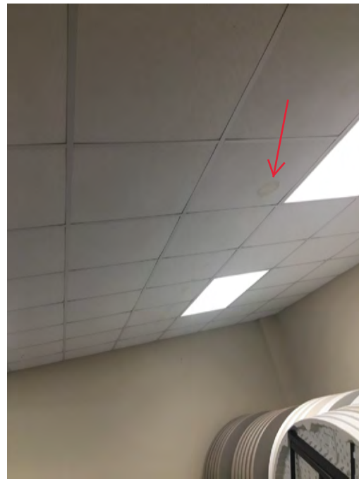
Photo 14: 2 FT x 2 FT White acoustic ceiling tile water damaged by rain water blown under ridge vent